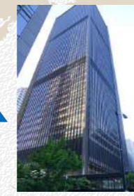
Hyogo Business and Cultural Center (Seattle)