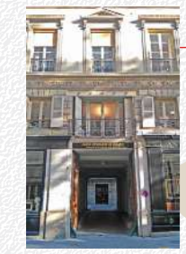
European Representative Office of Hyogo Prefecture (Paris)

Overseas Offices We operate three overseas offices to broaden our global network.