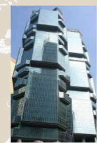
Hyogo Business & Tourism Center (Hong Kong)