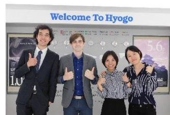
Hyogo's 4 CIRs