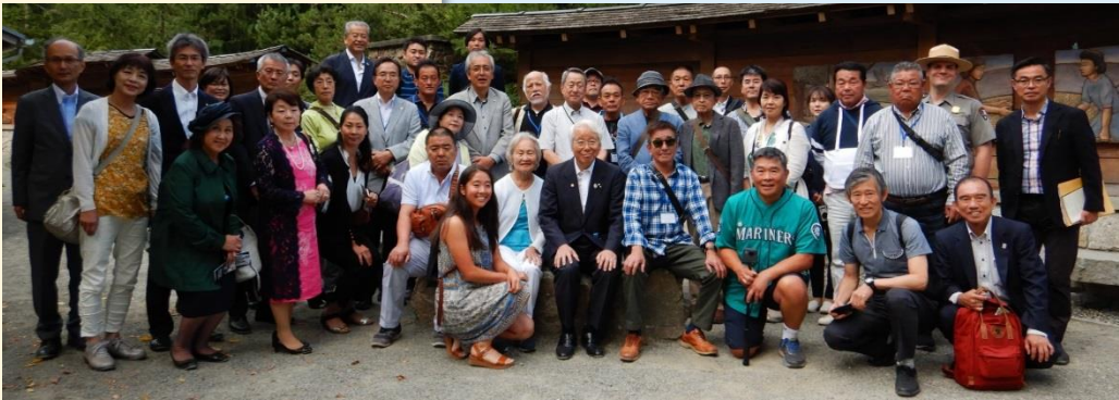
Visiting the Bainbridge Island Japanese American Exclusion Memorial

In Seattle city, they enjoyed their stay seeing the Seafair Torchlight parade and strolling through the beautiful cityscape. They visited San Francisco and enjoyed the summer days of the West Coast. Throughout the visit they experienced the further deepening of interactions between Hyogo and Washington and were able to make fond memories of the trip.