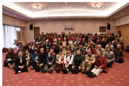
An impressive 130 attendees at the 30th anniversary reception

The Kobe Japanese Teaching Volunteer Association for Returnees from China accepts anyone wishing to learn Japanese and continues to support them for as long as they need, and their activities will surely continue to develop in the years to come.