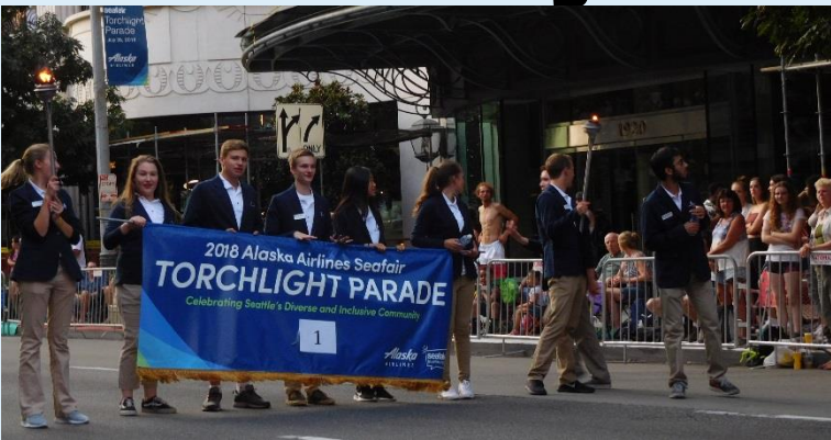
Seattle Seafair Torchlight Parade