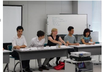
Presenters talking about their own experiences

At the beginning of this event, the participants watched a video of the TED presentation, after which the three presenters talked about their own experiences of introversion, extroversion and ambiversion.