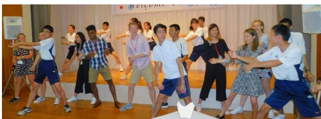
Dance performance by host students ~ Oxbridge students also joined in!

The Oxbridge English Summer Camp is an international program in which students from the Universities of Oxford and Cambridge in the U.K visit schools and other organizations in Hyogo prefecture. They run English conversation classes and other cultural exchange events to promote friendship between the two countries.