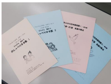
Original Japanese textbooks published by the association

[Who are the Returnees from China?] Japanese who were stranded in China after the war and lived there along with their families.