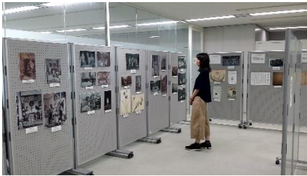
The exhibition displays