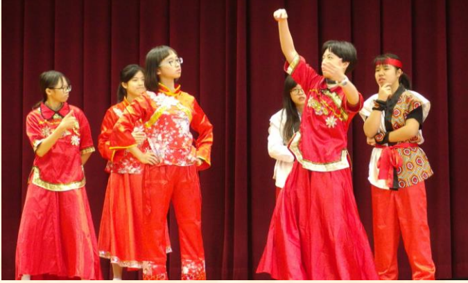
Theatrical folklore passed down through a Taiwanese ethnic minority

On Wednesday, January 23rd, a group of 84 students from the National Changhua Girls' Senior High School in Taiwan (77 students, 7 teachers and others) visited Himeji Nishi Senior High School for an exchange initiative. The Taiwanese students were divided into groups and, using English, experienced some traditional Japanese games such as hagoita, kendama, hyakunin-isshu karuta, and fukuwarai. There was also a performance of a play that was based on an old story inherited among a minority group in Taiwan, as well as a musical performance with the Japanese instrument of Koto, which became a precious experience of learning about cultures different from their own.