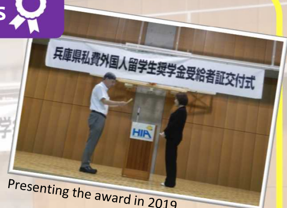
Presenting the award in 2019

About 150 students have been awarded this year, and we hope that they will study diligently while discovering the many charms of Hyogo.