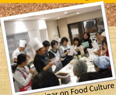
Seminar on Food Culture