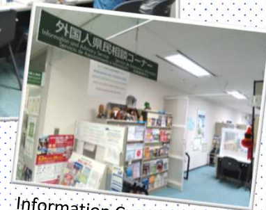
Information Center entrance