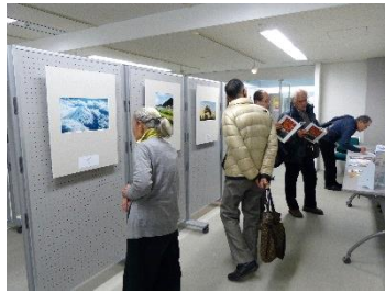
The photographic exhibition

From December 1 st to January 12 th , the Hyogo International Plaza hosted the "Through Diplomats' Eyes 2017" photography exhibit, which showcases images taken by foreign diplomats in Japan and provides glimpses into how they see the country.