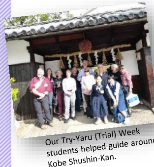
Our Try-Yaru (Trial) Week students helped guide around Kobe Shushin-Kan.

In Kobe they visited Kobe Shushin-Kan, tasting sake and observing the sake-making process, while in Himeji they learned about the history of Himeji castle and visited Engyoji temple with a priest's guidance. In Miki, they made their own knives and purchased locally made ones, and in Tanba they visited the Museum of Ceramic Art, Hyogo and the Tachikui Pottery village. Finally in Awaji, they were impressed by the whirling waves and enjoyed a Japanese puppet show. They enjoyed many special activities around the Kyu-gokoku (five ancient countries of Hyogo) including the healing properties of the Arima and Kinosaki hot springs.