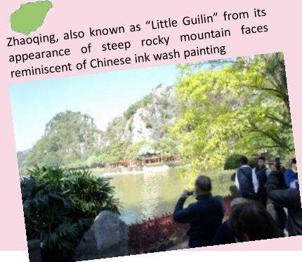
Zhaoqing, also known as "Little Guilin" from its appearance of steep rocky mountain faces reminiscent of Chinese ink wash painting