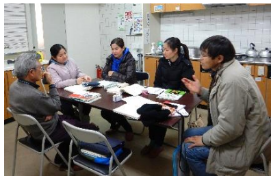
Volunteers work to teach Japanese in a simple manner