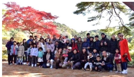
Classroom excursion for viewing Autumn leaves