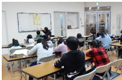
Children learning Vietnamese! ~ attempting difficult pronunciation

We are sure that Ms Oanh’s efforts, ever looking ahead to the future of both countries, will continue to spread.