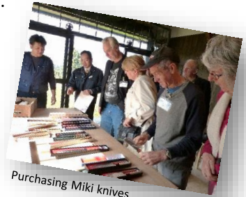
Purchasing Miki knives

This tour was originally held 4 years ago, and it was planned again due to its popularity. It was clear the number of "Hyogo Fans" was growing as many people were joining tour for the second time.