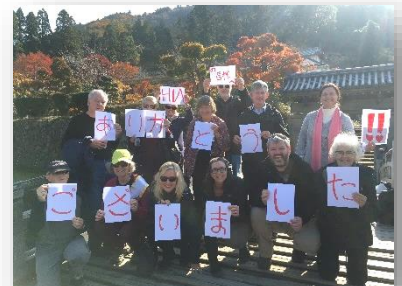
The delegation members sent us pictures with gratitude

We hope that not only the people who joined the tour, but also everyone who was involved with the tour will share their experiences with their families and friends so that the relationships between the countries and people will grow deeper and the intercultural roots will continue to spread.