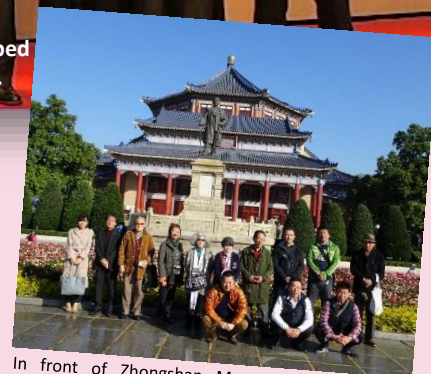
In front of Zhongshan Memorial Hall, built in commemoration of Sun Yat-sen who had ties with Hyogo prefecture (Guangzhou city)

The warm and friendly atmosphere helped deepen the mutual friendship between the delegation and locals as well as between the delegation members themselves, making this visit both wonderful and fruitful.