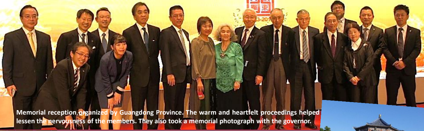
Memorial reception, organized by Guangdong Province. The warm and heartfelt proceedings helped lessen the nervousness of the members. They also took a memorial photograph with the governor.